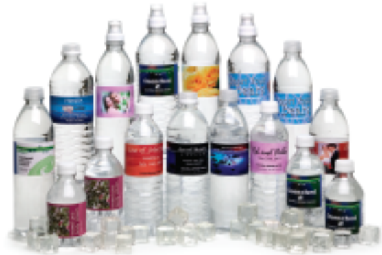
Water Bottle Labels

The LX810 prints onto many different label and tag materials, including inkjet coated high-gloss, semi-gloss and matte labels. Labels printed on high-gloss material are highly scratch- and smudge-resistant and virtually waterproof. This is a perfect solution for primary or box labels that can be exposed to water, rain and snow.