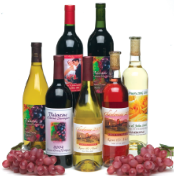
Wine Bottle Labels

The LX810 produces gorgeous, professional-quality labels for all your short-run, specialty products. It is also perfect for a host of other uses such as proofing before going to press on longer runs. Test marketing. Contract manufacturing. Private label goods. Promotional labels. Full-color box-end labels with all the required bar codes. And much more.